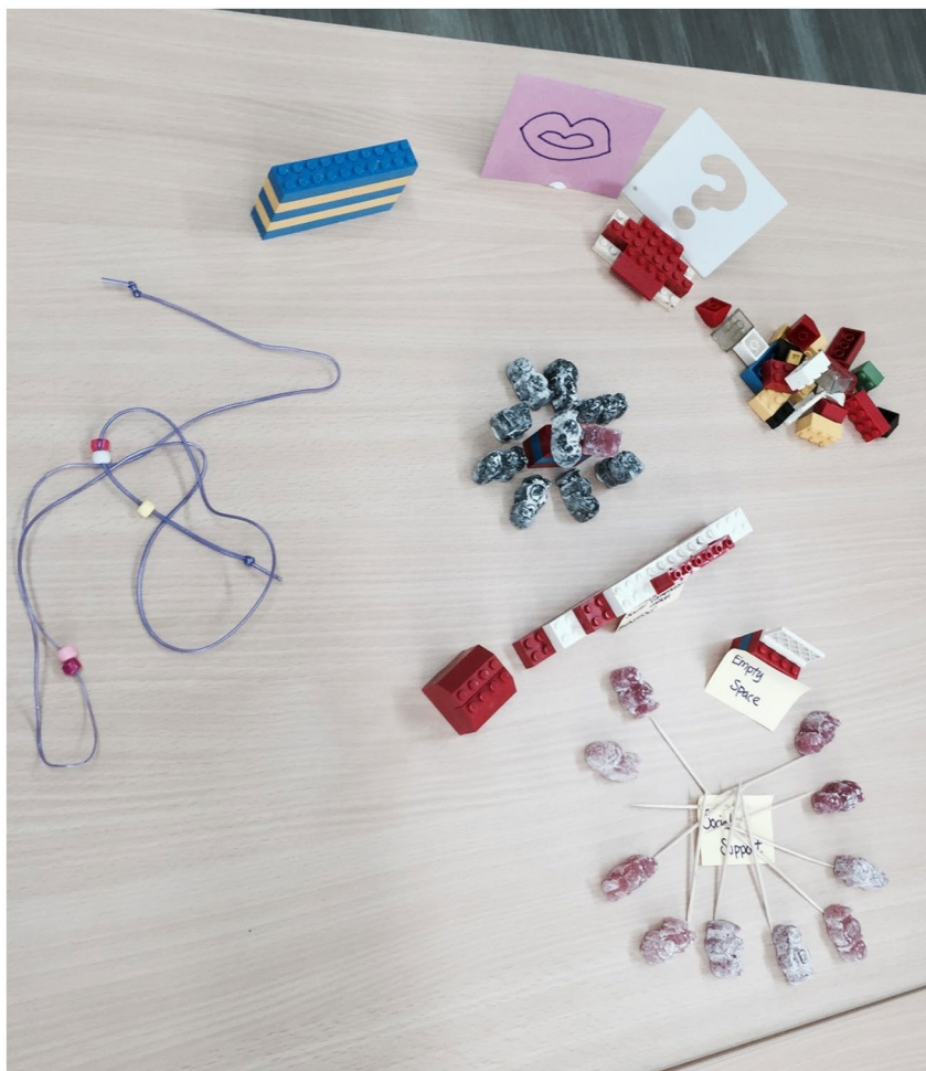
Figure 1. A 3D model of the perception of the situation at the beginning of the project for pupils with autism in Nantsdale School

Note: Those with autism are by themselves at the top right by the question mark; the rest of the class, all well connected, are at the bottom right behind the barrier